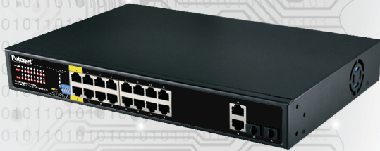
16-Port Gigabit PoE+ Switch 2 Gigabit RJ45 & 2 SFP Uplink Ports