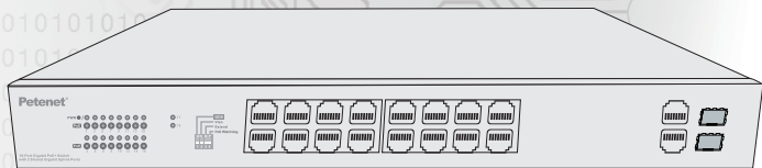
16-Port Gigabit Unmanaged PoE+ Switch